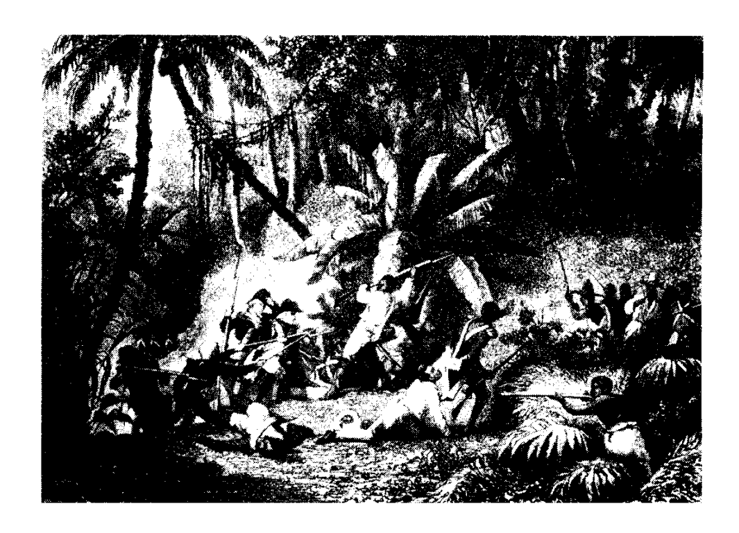
Battle in Saint-Domingue, a contemporary engraving